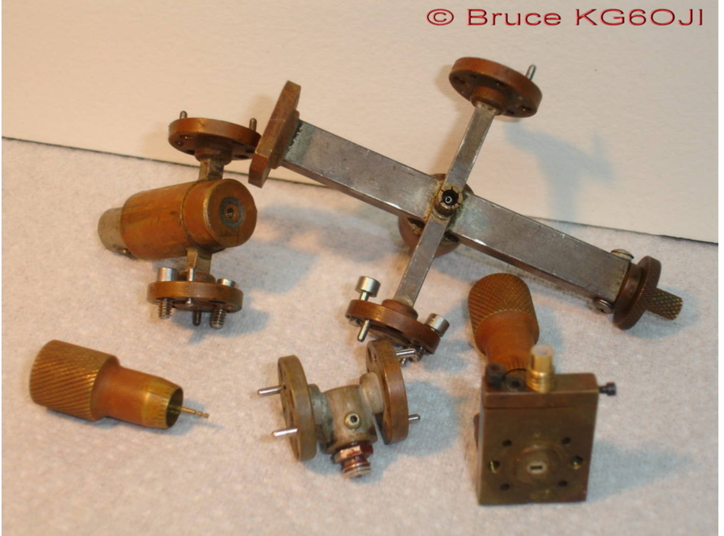
Upper left: WR-8 detector with silicon die on 2-56 screw inserted from the top. Upper right: Cross-guide multiplier with socket for 1N26 (included to illustrate this method). Bottom left: WR-8 adjustable choke short. Bottom Center: WR-8 thermistor mount constructed as I described above in my message. Bottom right: Stable WR-8 detector.