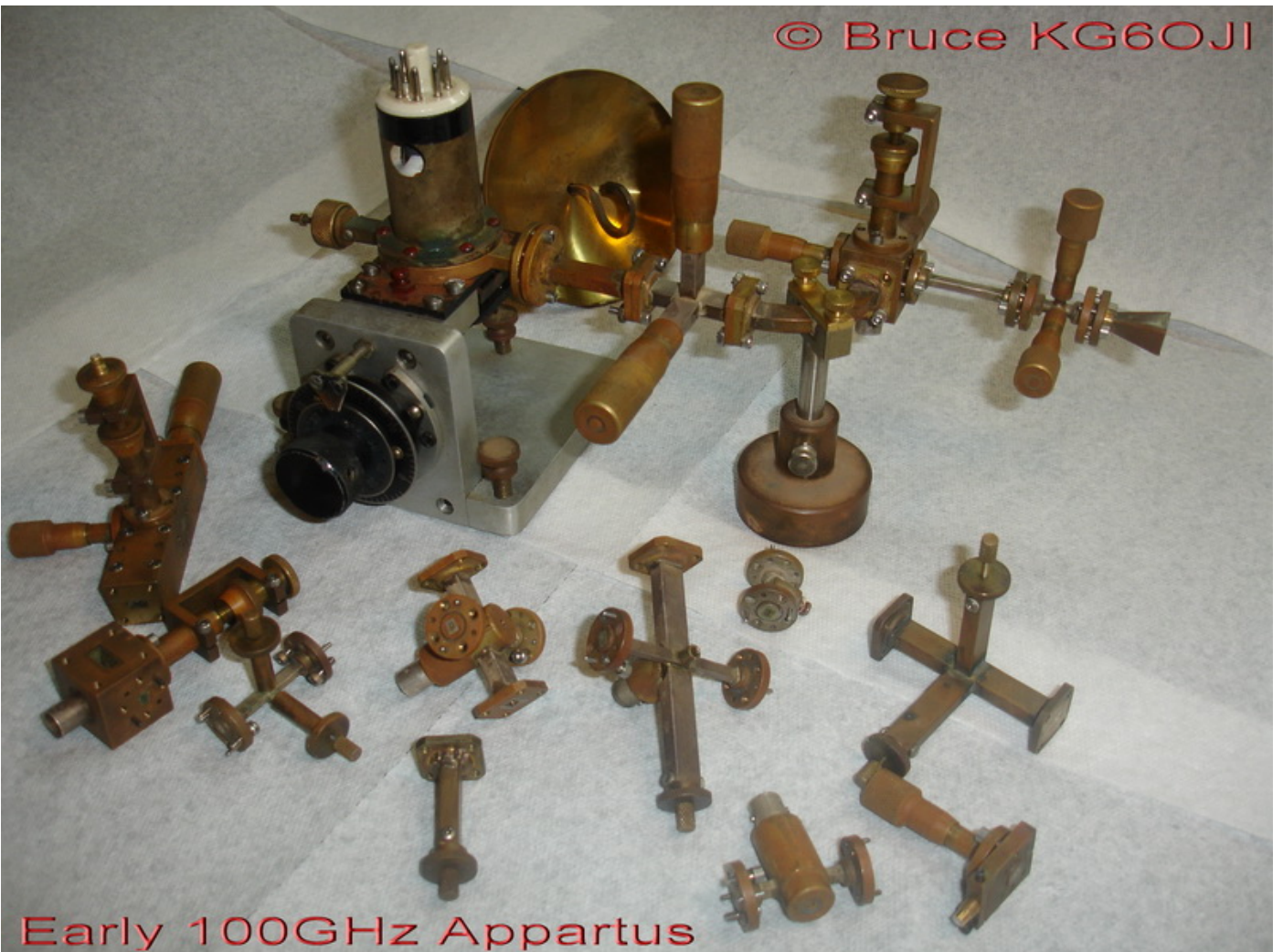
Early 100GHz Appartus