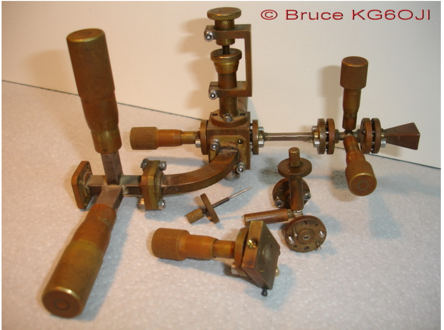
Multiplier assembly in background included to illustrate differential screw mechanism. Center: WR-8 adjustable short from E/H tuner to its right. Bottom: Bottom side of "very stable" detector showing 2-56 screw carrying silicon die inserted from bottom.