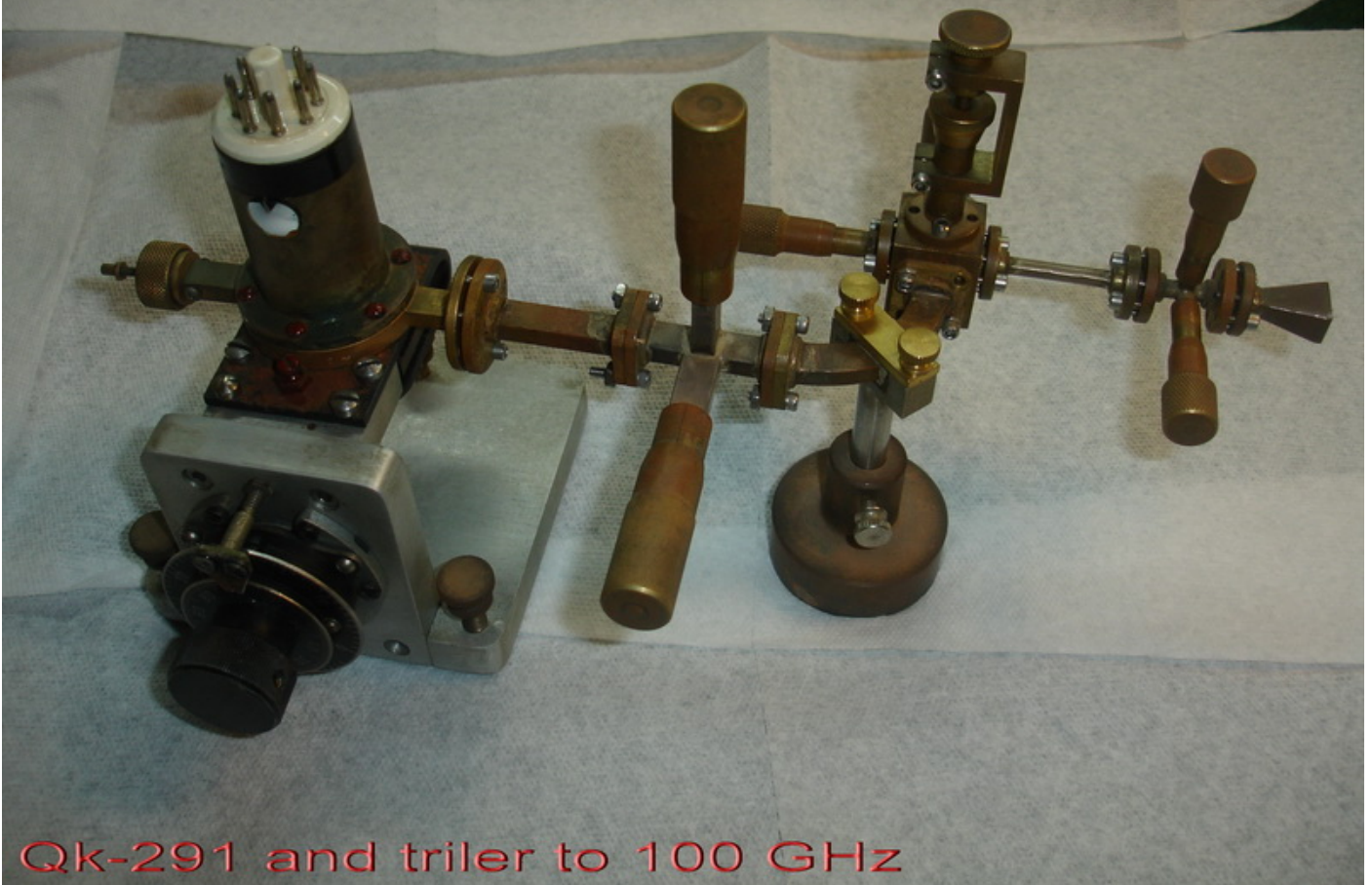
Qk-291 and triler to 100 GHz